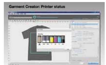
Upgraded Epson Garment Creator 2 software for Macintosh ® & Windows ®