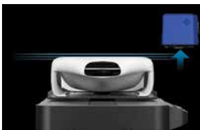
Rapid loading with tool-less macro and auto fine height adjustment