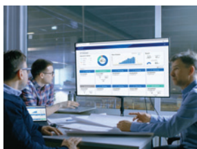
Epson Cloud Solution PORT provides upgraded management reporting, enhanced support & service with optional User Head Replacement