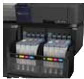
High capacity 15 / 18L CISS. Tanks can be refilled while printing continues