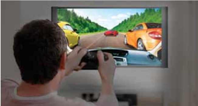
Play larger-than-life video games with vibrant color graphics. Just connect your Nintendo® Wii™, Microsoft® Xbox 360® or Sony® PS3.

Brilliant, awe-inspiring projection lets you display media from virtually any digital device with stunning clarity and color up to 12x larger than a 40-inch screen.