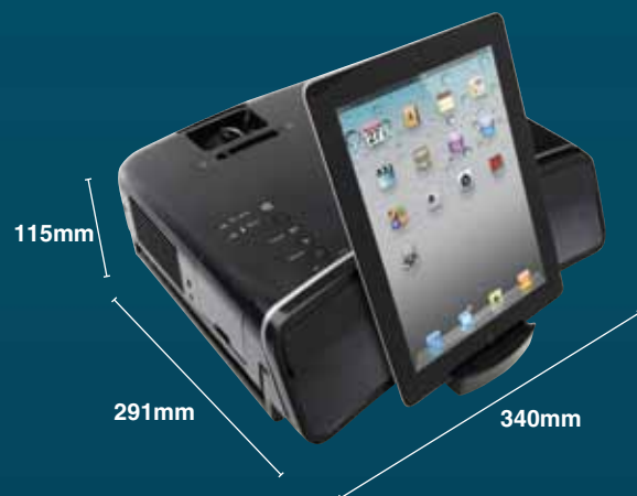
▲ Built-in Apple dock