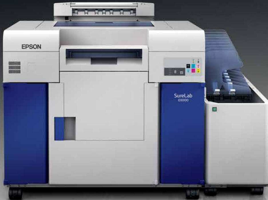
Shown with Optional Print Sorter