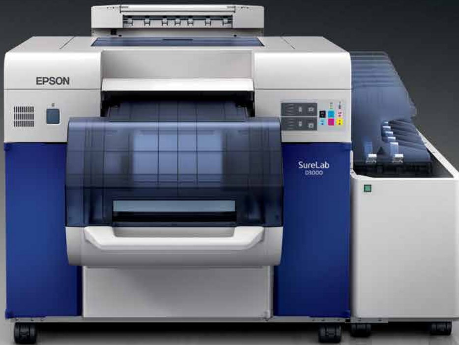
Shown with Optional Print Sorter

One Roll up to 12" Plus an Additional Roll up to 8" Wide