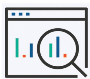
Cost & Usage Analysis