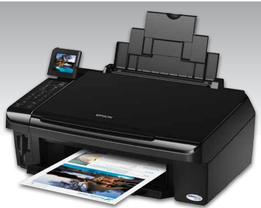
*Memory card not included