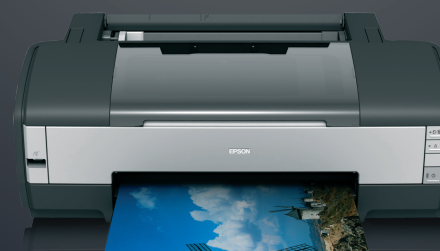
Epson Stylus® R1410 A3+

Epson Stylus® Photo Printer leaving nothing to be desired