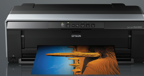
Epson Stylus® R2000 A3+