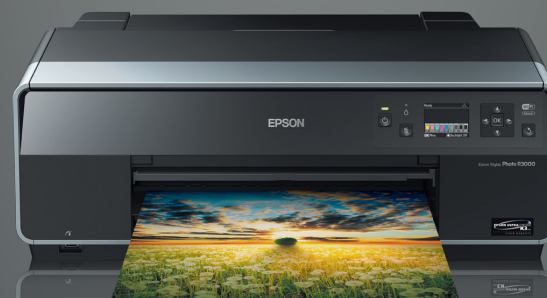
Epson Stylus® R3000 A3+